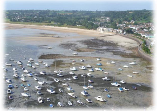
HARBOR AT GOREY, JERSEY, AT LOW TIDE

People have noticed for millennia a connection between the position of the moon and the tides. As people studied more and more, it became evident that the tides were not just caused by the moon, but also by the sun. Both of these objects “reach out” through space to pull on the water on our earth, making the water bulge that appears to move around the earth (actually, the bulge stays in about the same place, it’s the earth that is spinning under it). When astronauts landed on the moon, they dropped objects to confirm, for all to see, that the moon pulls on objects just like the earth (only not as strongly).